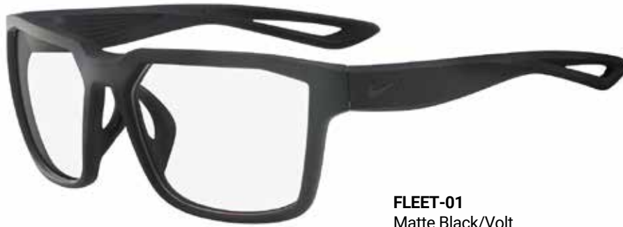
FLEET-01 Matte Black/Volt