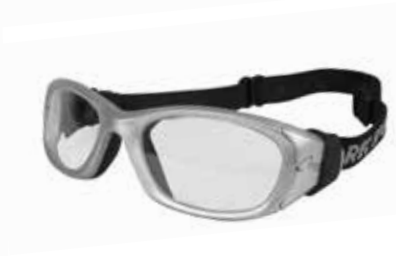
800077 Plated Silver