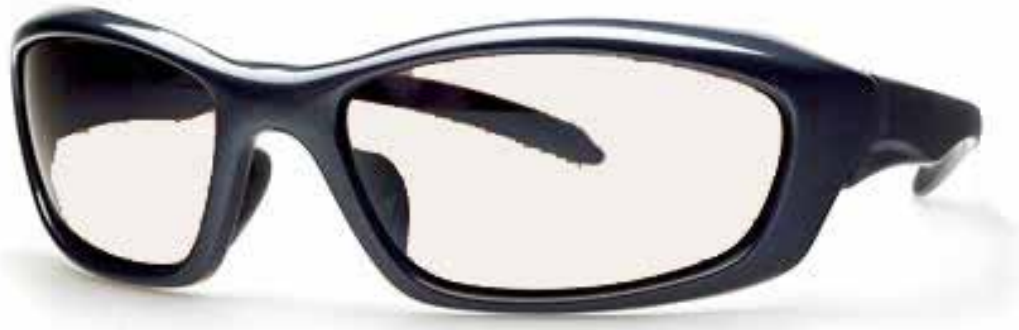
80081 Shiny Black