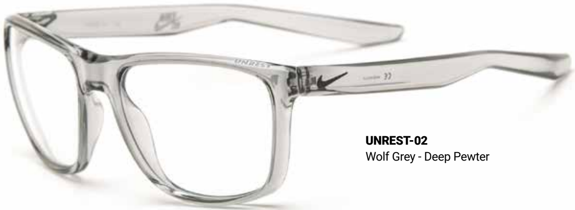
UNREST-02 Wolf Grey - Deep Pewter