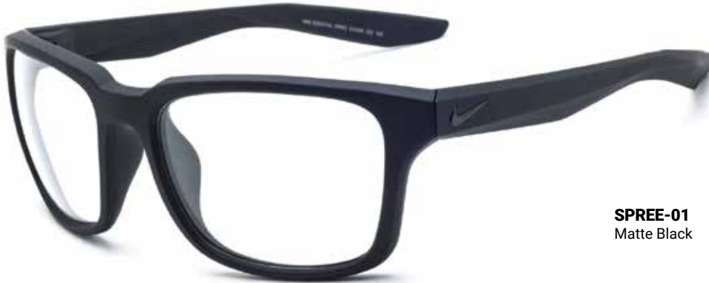
SPREE-01 Matte Black