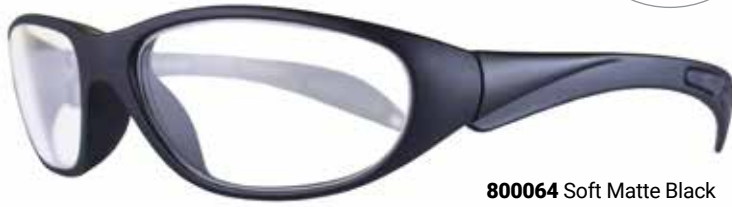
800064 Soft Matte Black