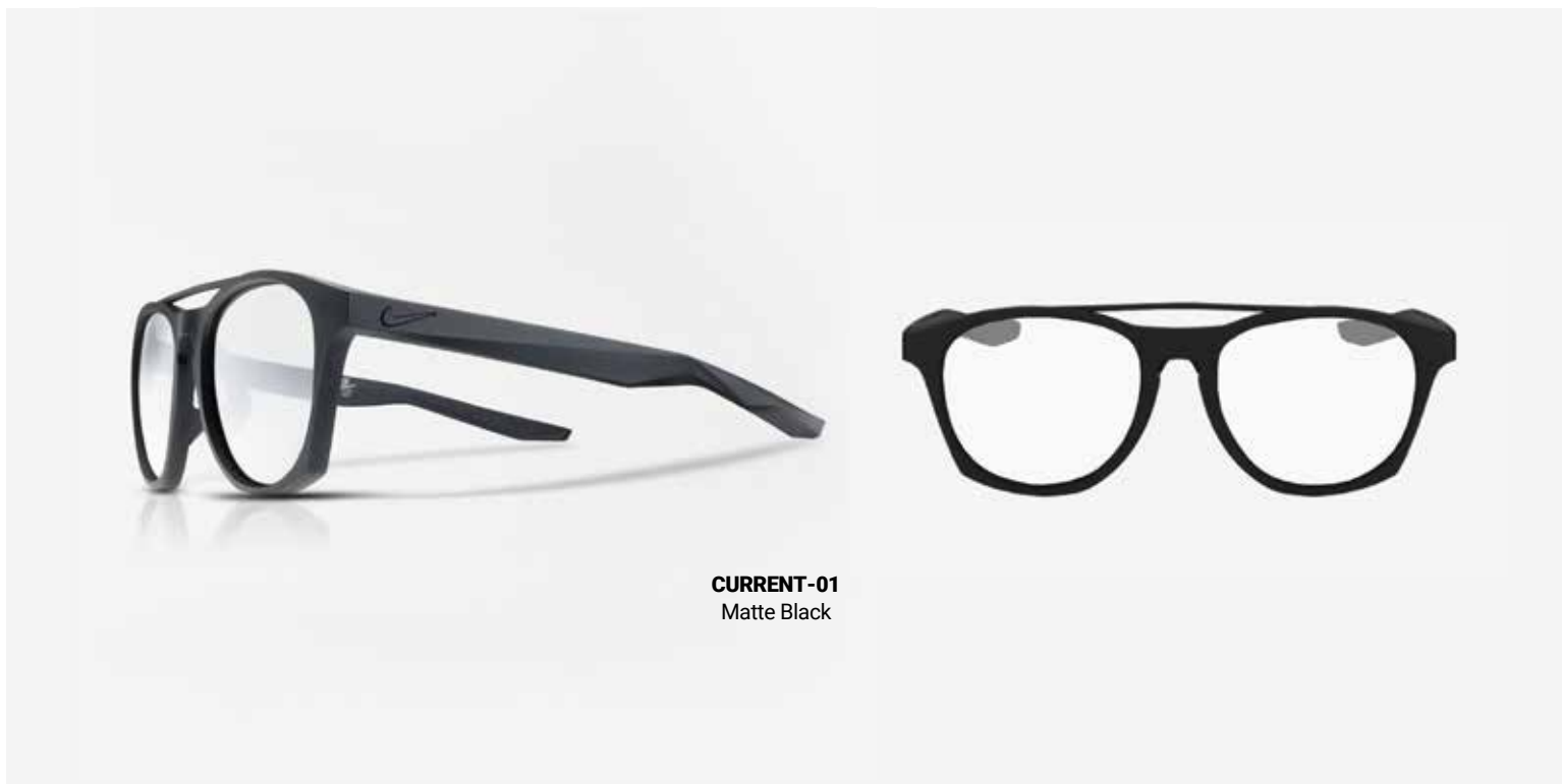
CURRENT-01 Matte Black