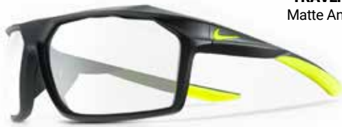
TRAVVERSE-02 Matte Anthracite

The Nike Traverse Lead Glasses provide a secure fit and sharp vision.