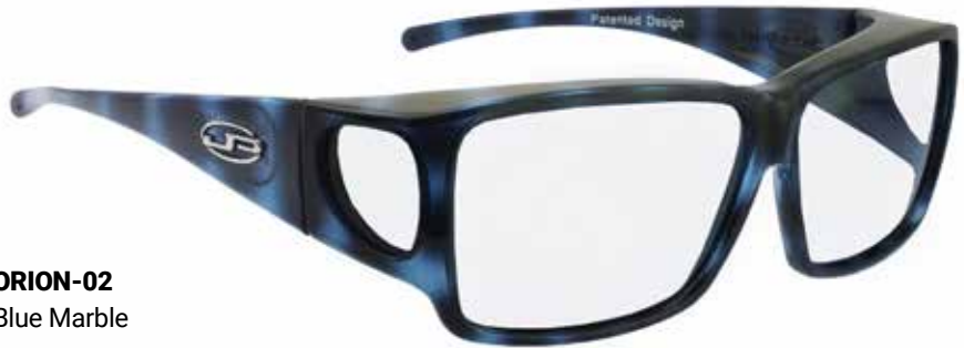
ORION-02 Blue Marble