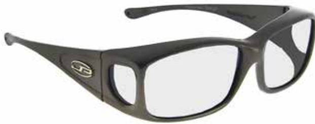
800240 Gun Metal