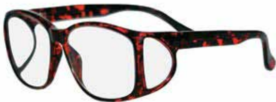
683213 Tortoise Shell