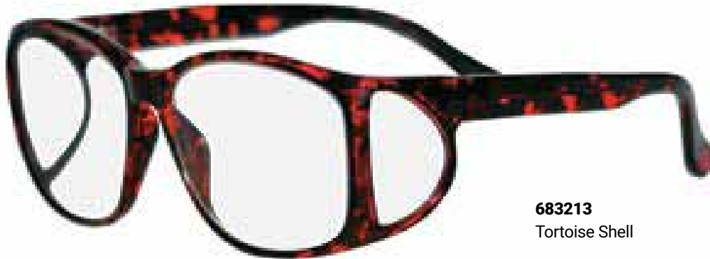
683213 Tortoise Shell