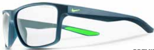
PREMIER-05 Matte Blue

Lightweight and comfortable, the Nike Premier lead glasses feature slimmed down temples with tips that grip for stability.