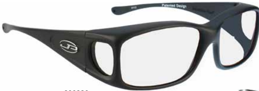
800230 Matte Black

Fits over Rx glasses not exceeding 132 x 38mm.