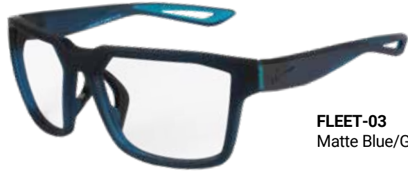
FLEET-03 Matte Blue/Grey

The Nike Fleet is a full rim square frame which comes with nose pads that snap into the pad box. It features our standard high quality, distortion-free radiation-reducing lenses with .75mm lead equivalency.