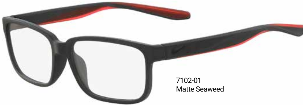
7102-01 Matte Seaweed