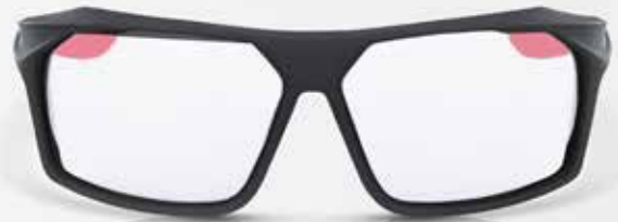
TRAVVERSE-01 Matte Black