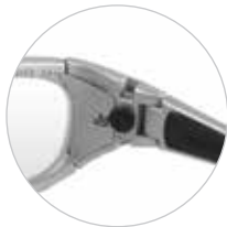
Optional Side Protection