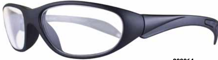
800064 Soft Matte Black