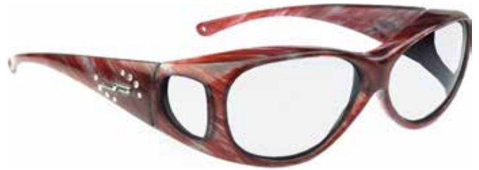
800307 Claret Stripe