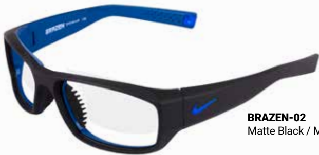
BRAZEN-02 Matte Black / Military Blue