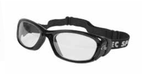
800079 Shiny Black

Vented radiation protection goggle with neoprene foam on the inside designed to protect against fluid splashing and perspiration