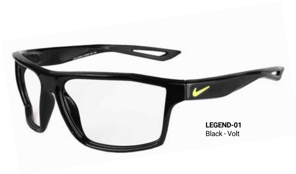
LEGEND-01 Black - Volt