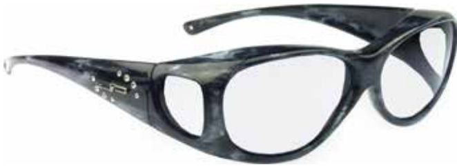
800306 Smoke Marble