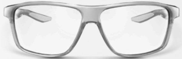
PREMIER-04 Cool Grey