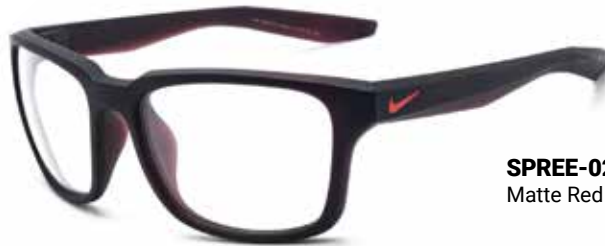
SPREE-02 Matte Red