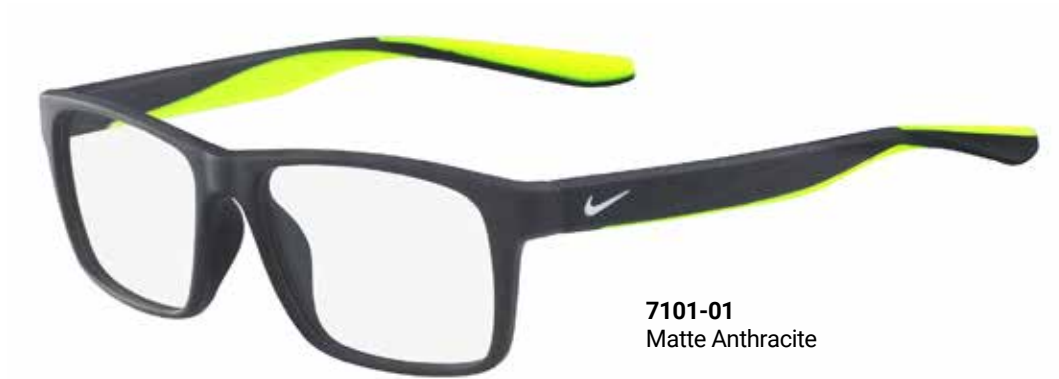
7101-01 Matte Anthracite