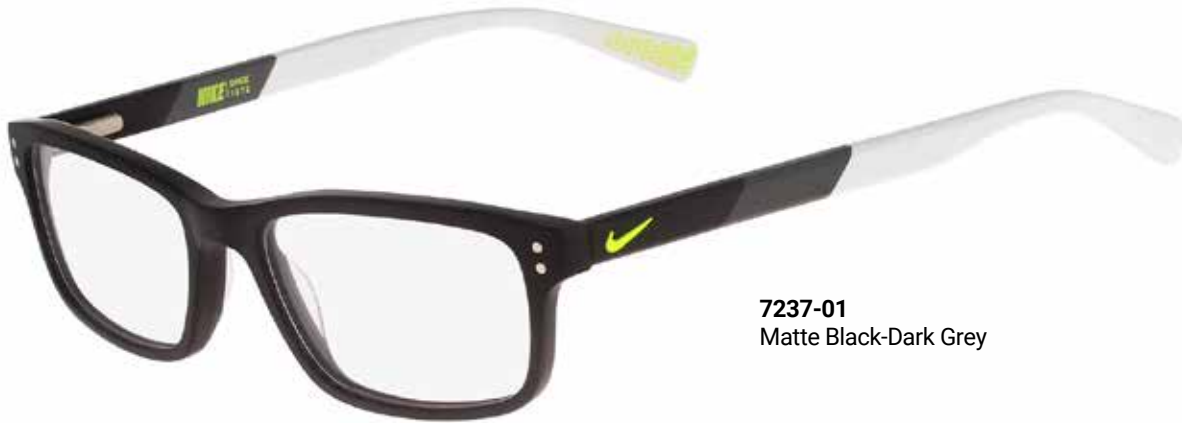
7237-01 Matte Black-Dark Grey