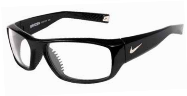
BRAZEN-04 Shiny Black