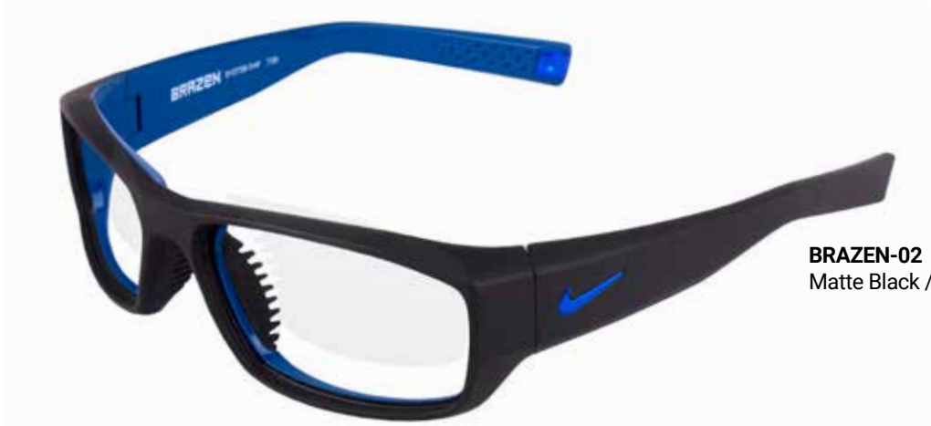
BRAZEN-02 Matte Black / Military Blue