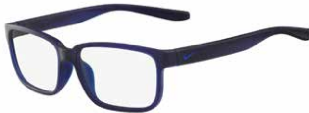
7102-02 Matte Navy