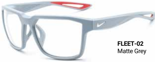
FLEET-02 Matte Grey