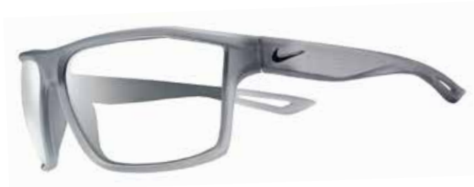
LEGEND-02 Matte Wolf Grey - Obsidian