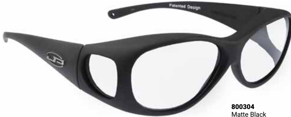
800304 Matte Black