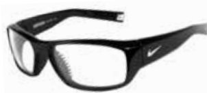
BRAZEN-04 Shiny Black