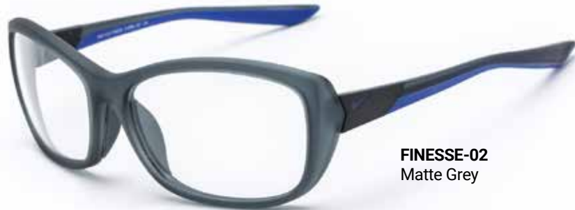
FINESSE-02 Matte Grey